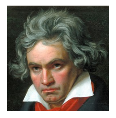
Ludwig van Beethoven was born in 1770 in Germany.

He is one of the most famous composers in western music, and was one of the first composers to write in the 'Romantic' style.