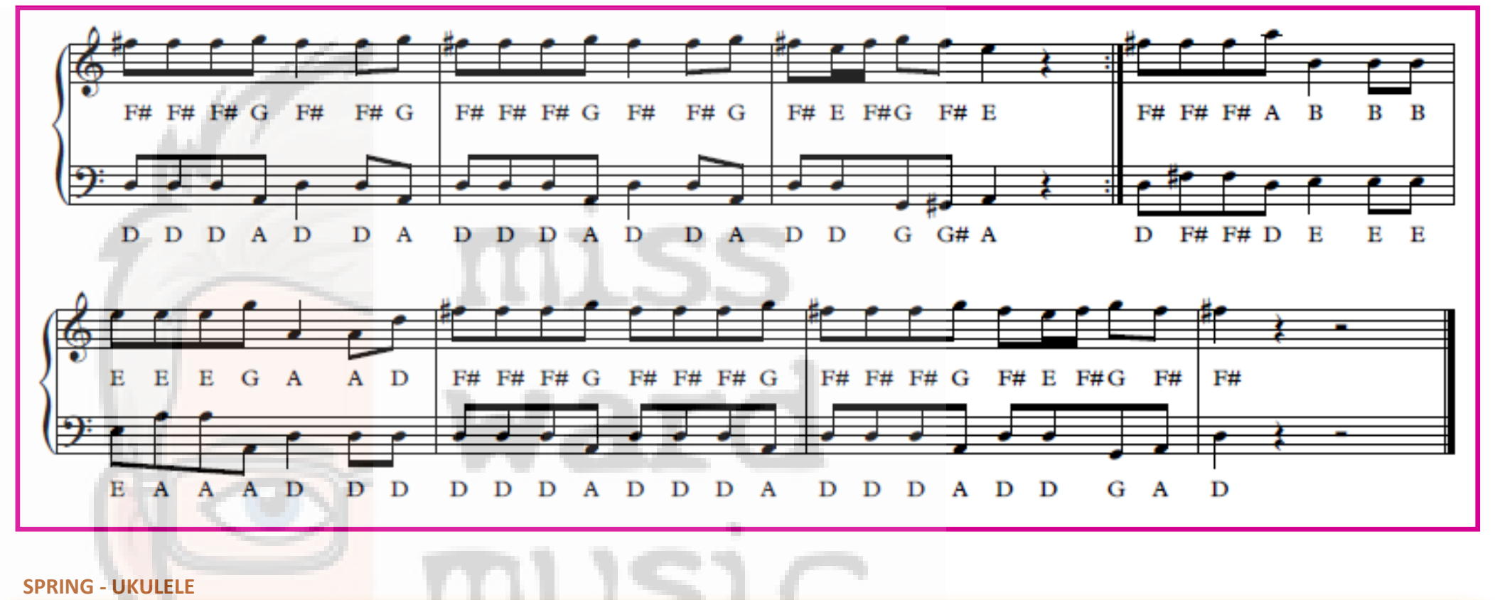
The four seasons - Autumn